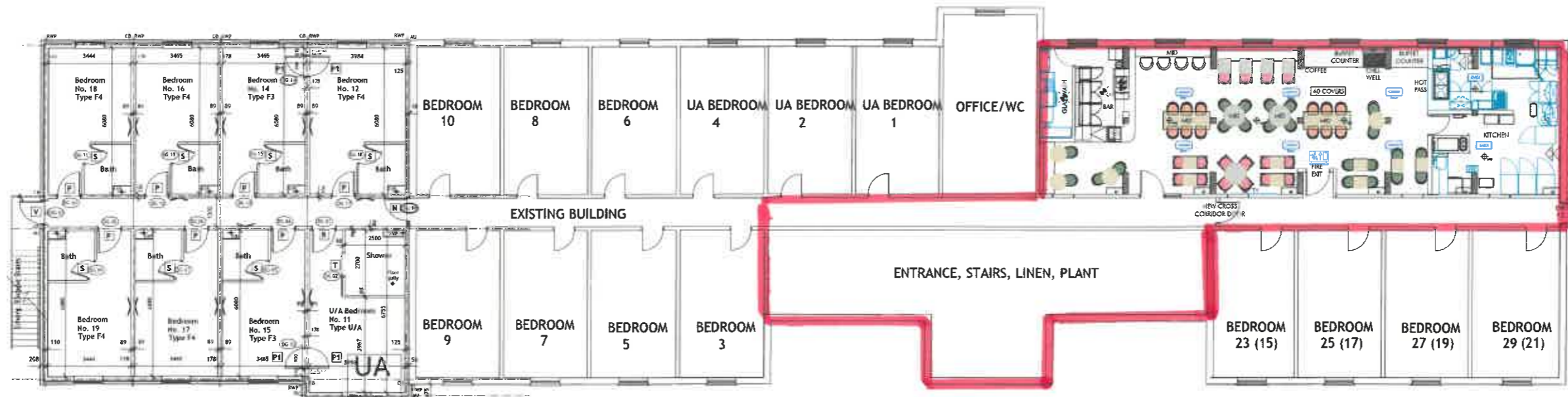
GROUND FLOOR LICENSING PLAN SCALE 1:100 @ A1